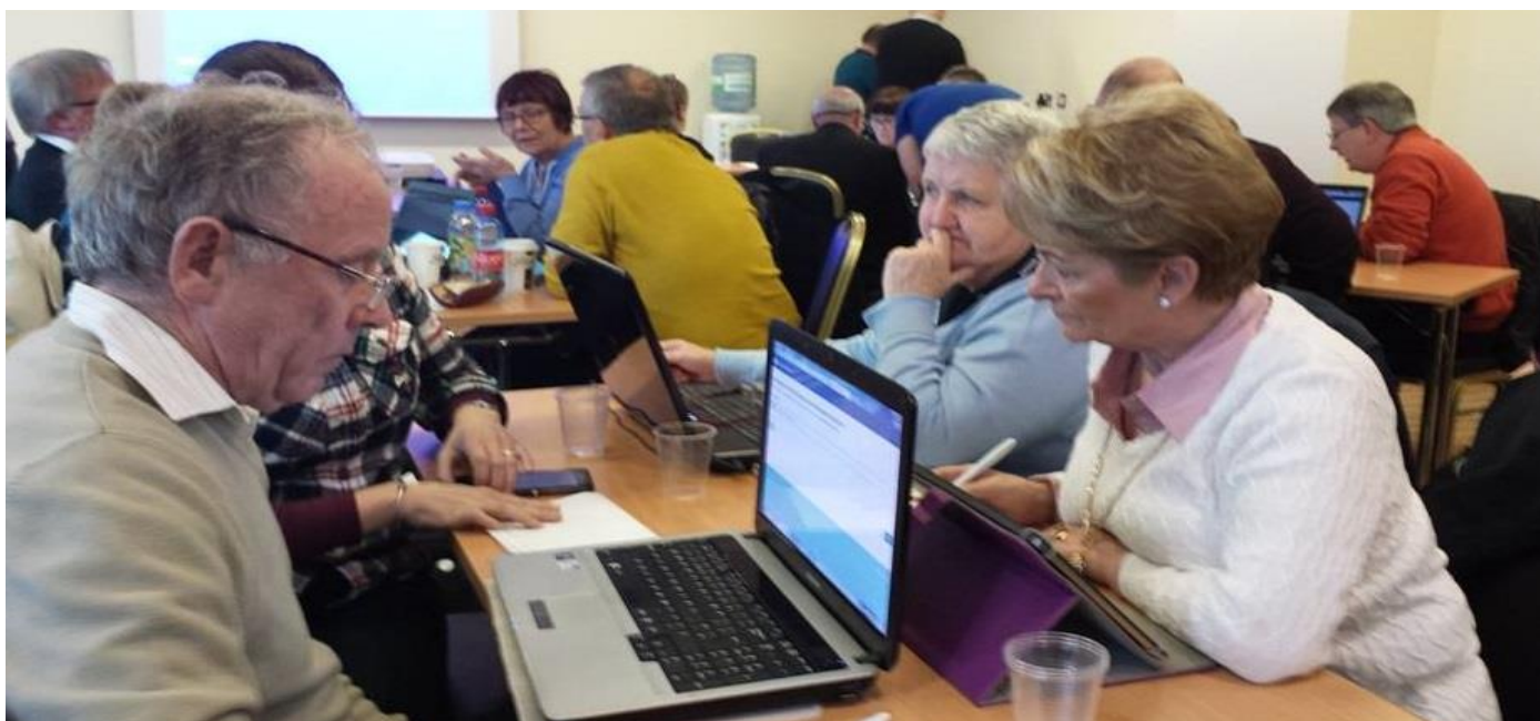
Training in full swing as club administrators get to grips with the new PPUI Handicap system. Over 50 club delegates and administrators were present at the Maldron Hotel in Portlaoise as the Handicap Committee present the new system

The new system is live and ready to use, available at www.ppui.ie/handicapsystem . From here club administrators can manage their courses and competition and each member can check their current playing handicap. Keith has also kindly put in video tutorials on how to use the system which will help as the sport transitions into the new system.